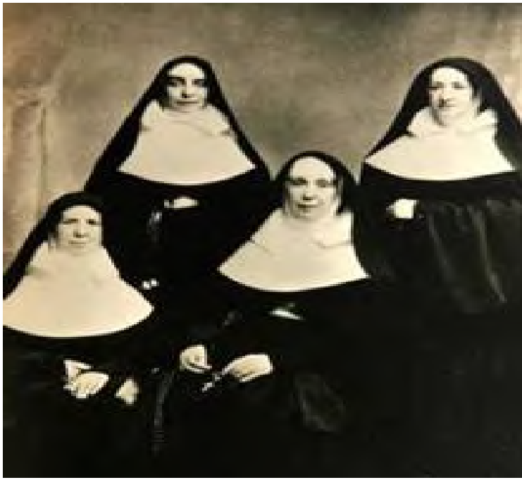
Sisters of Mercy